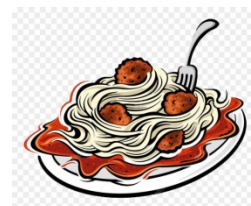
spaghetti and meatballs